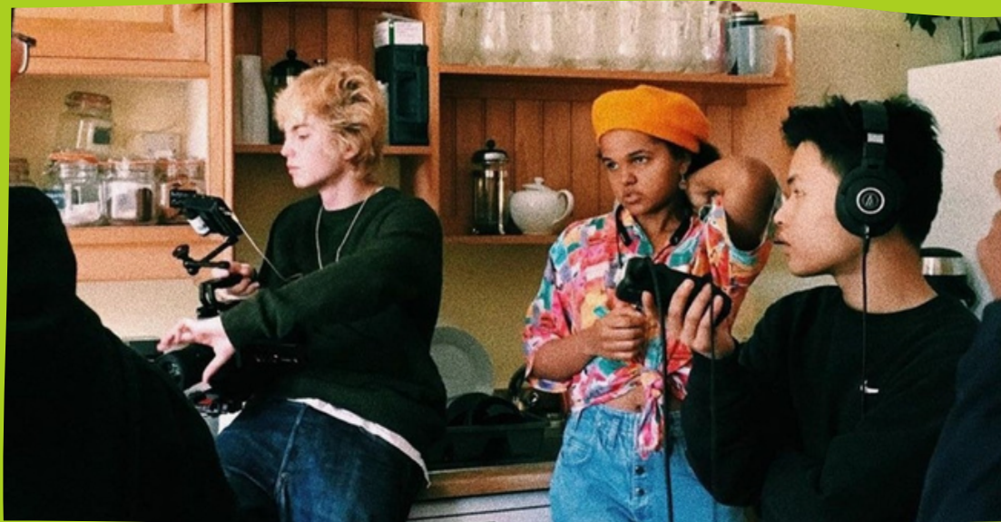
DIGITAL MEDIA INNOVATORS

The programme does not follow an EFL curriculum (English as a Foreign Language), instead, our courses were built to engage and challenge students in an interactive environment. The lessons are full of lively discussions, debates, competitions and opportunities for them to practise what they learn.